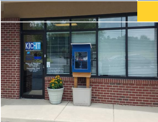
Blessing Box: 24/7 outdoor food pantry (blue box) available to anyone of any age in need!

If you are outside of KIC-IT's age demographic of 16-25 , please contact United Way of Johnson County Helpline 317-738-4636 for assistance.